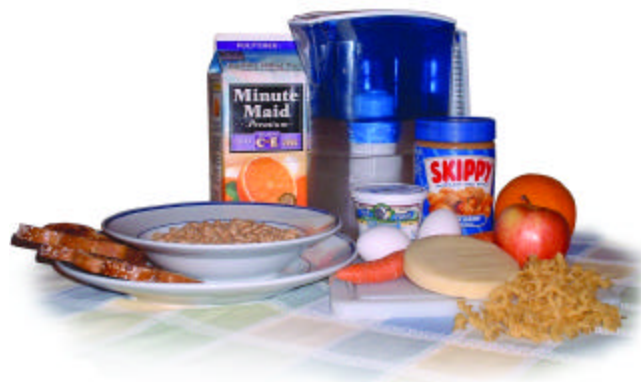
A healthy diet is important.

White flour mixed with water, as any school age child will know, turns into glue. Ingested, white flour turns into glue in the stomach. (Compare this result vs. mixing water with whole wheat flour. Glue is NOT formed.) The intestinal glue can clog up food absorption for a short while until it is broken down. And then it breaks down into sugar which gives energy for a short time, but then disappears, giving the eater a hypoglycemic "let down".